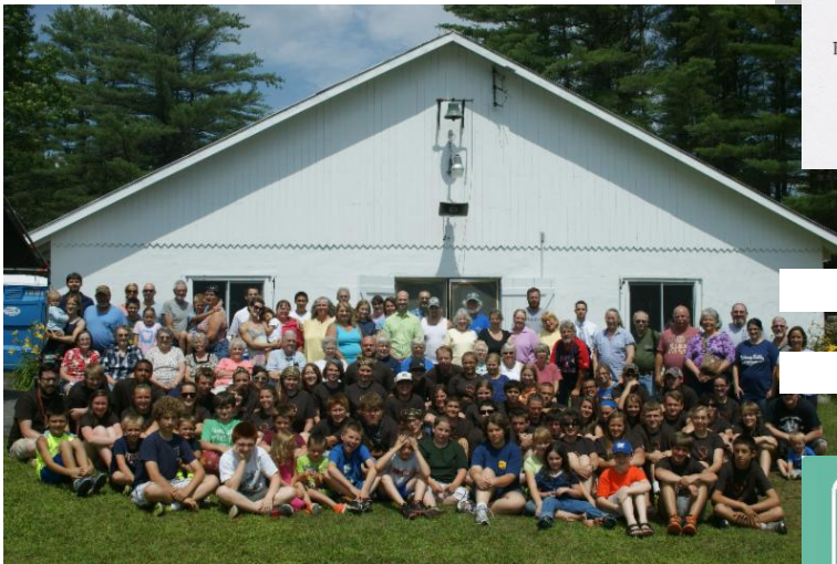
Mechanic Falls Camp Celebrates 125 years!