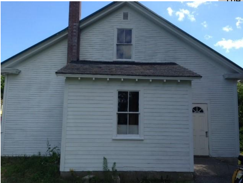
Community Lighthouse Advent Christian Church Farmington, NH

Farmington AC Church fellowship Hall that was painted by the Summer Ministry Team.